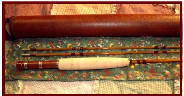
Custom rod to be raffled on March 20 th

http://www.rodbuildingforum.com/index.php?showtopic=24020&st=0