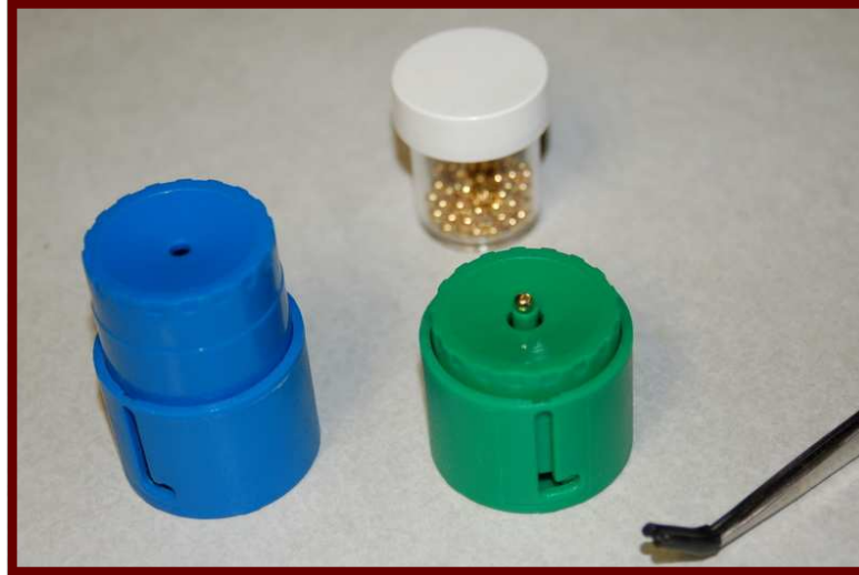
These handy dispensers present a single bead at a time Just push the housing down and a bead "pops" up

better method is to pick the right bead based upon a standard; not a guess.